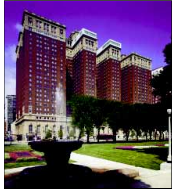
Hilton Chicago Hotel